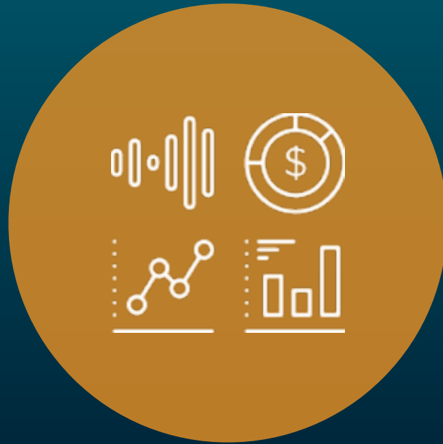
Customers are buying solutions