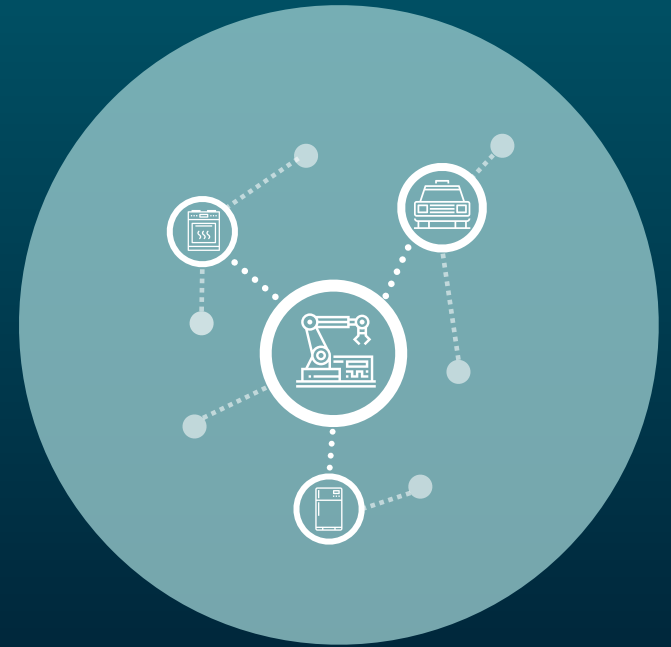
Customers increase their expectations