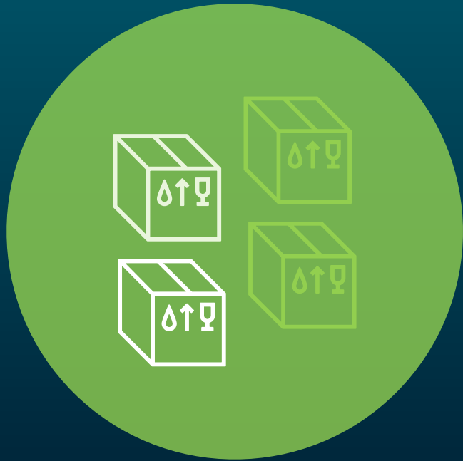
Products Become Services